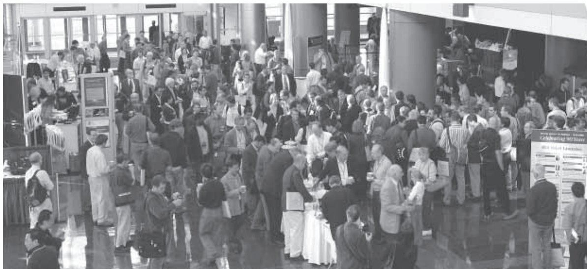
Attendees during a coffee break at FiO/LS 2006