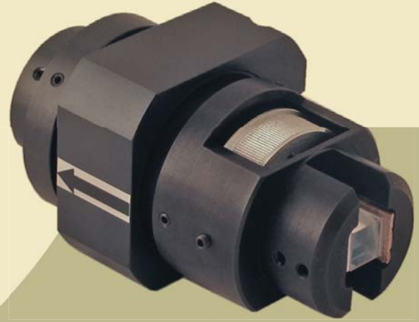
Tunable Faraday optical isolator for 730-860 nm